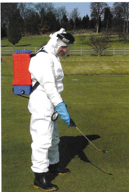
Correct PPE for responsible spraying