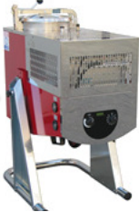
Si/Di30A 30 litre