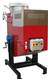
Si/Di160A 160 litre

The Standard Distatic models are available in non-flammable (S series) and flammable (D series ATEX Certified) versions with copper or stainless steel condensers. The standard distillers use air cooled condensers but water cooled versions are available as a no cost option in most cases. The Distatic distillers are available in load capacities of 15, 30, 60, 120 and 160 litres. The actual load capacity should not be confused with the total boiler capacity which is always greater. Our distillers are constructed in a way that always provides sufficient free space inside the boiler to ensure efficient operation. The model number denotes the load capacity, a Di60 holds 60 litres but the overall capacity is 109 litres.