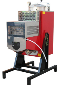
Si/Di60A 60 litre