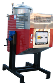
Si/Di120A 120 litre