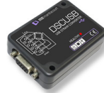
DSC-USB USB Signal Digitiser