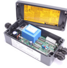
SGA Signal Conditioner/Amplifier