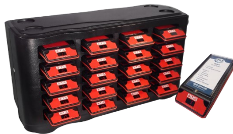
Ultra Quiet Call Pager