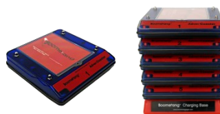
Titan Quiet Call Coaster pager