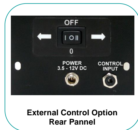
External Control Option Rear Panel

The External Control Option allows the printer to control the rewriter. Several printer manufacturers now offer the necessary signal as standard, where before an expensive I/O board was required. Ideally, the printer will activate the rewriter only when printing or feeding forward. Because of the unique direct drive motor technology used, this scheme allows the printer to back-feed without any resistance from the rewriter.