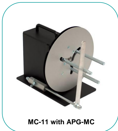
MC-11 with APG-MC

The MINI-CAT (MC) Label Rewinders are the world's most popular low-price Label Rewinders. They are capable of rewinding label rolls up to 125mm wide (115 mm for MC-11), up to 220 mm in diameter at speeds up to 50 cm/sec.