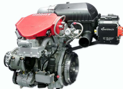
>> eBoost Downsizing Engine