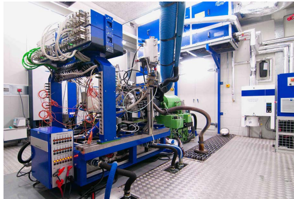
>> Engine Test Cell with Quick Change Pallet System

MAHLE Powertrain provides a broad spectrum of skills and capabilities to our global customers. With expert knowledge and a detailed understanding of new technologies, MAHLE Powertrain supports the automotive industry with optimised solutions.