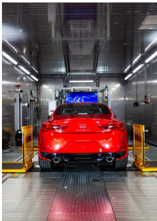
⌆ Car on 4WD dyno with altitude simulation