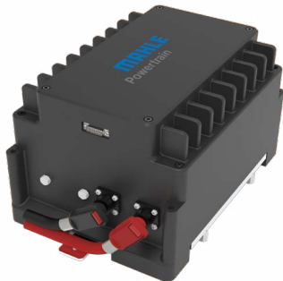
>> 48V Battery Pack