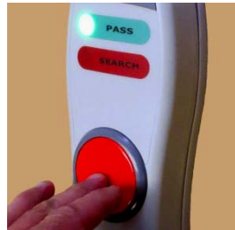
Wall Mounted Unit