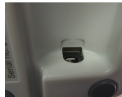
Built-in 12v Input Socket