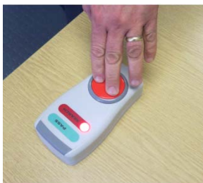
Desk Mounted Unit

The wall mounting bracket facilitates easy fixing of the unit in a permanent position on a wall or desktop, or can be left permanently attached to the unit when it is being used as a mobile device.