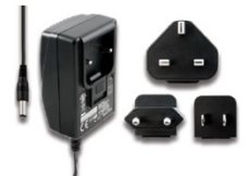
International Mains Adaptor (optional)