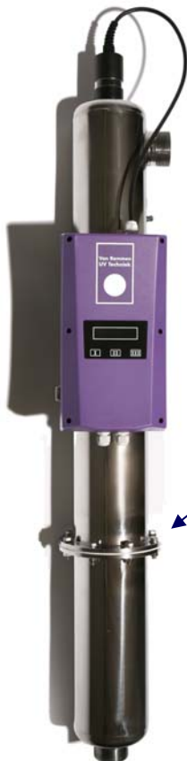
Flow Management System