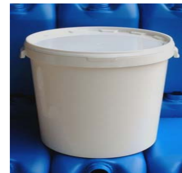
Integral Side Handle - Round (30 litre only).