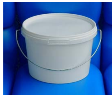
Metal Handle No Grip - Round (Various sizes from 2.5 litres to 9 litres).