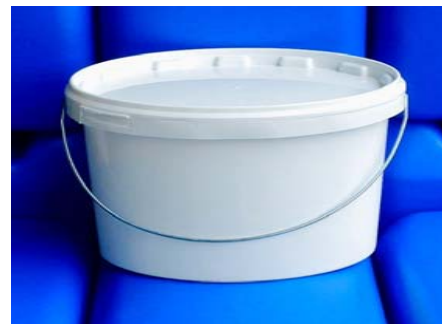
Metal Handle Oval (6 litre only).