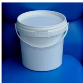
Plastic Handle (Various Sizes from 500mls to 10 litres).