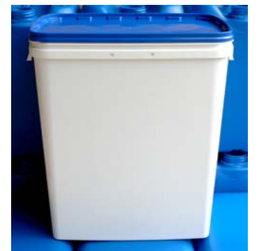
Integral Side Handle - Rectangular (33 litre only).