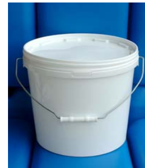
Metal Handle with Grip - Round (From 10 litres to 25 litres).