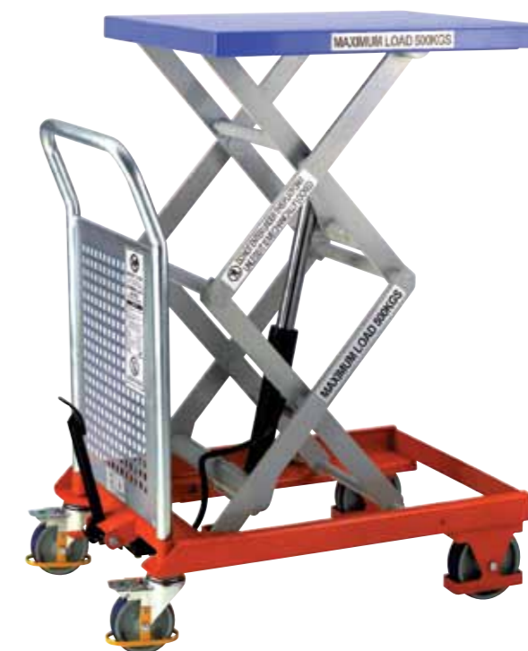
Foot hydraulic model MSL500T