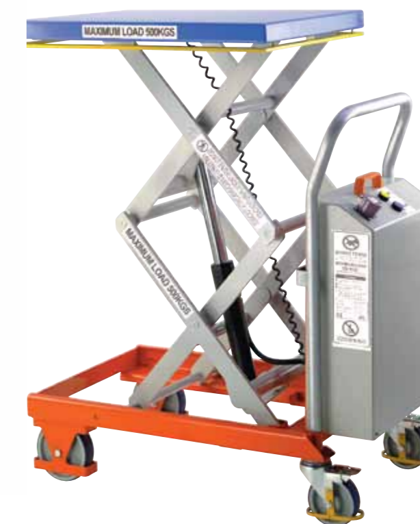
Electro hydraulic model MSL500TE