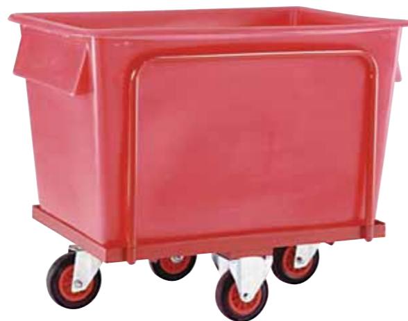
Balance wheel configuration Model CT89