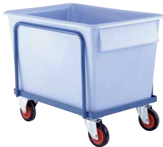
Standard Model CT82