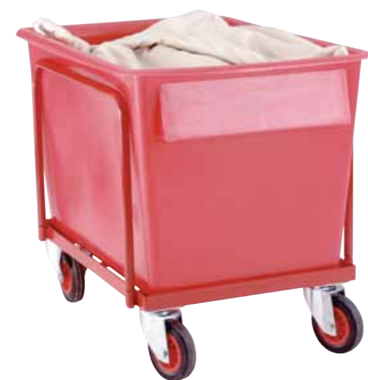
Standard Model CT88

For food grade container trucks, see previous page.