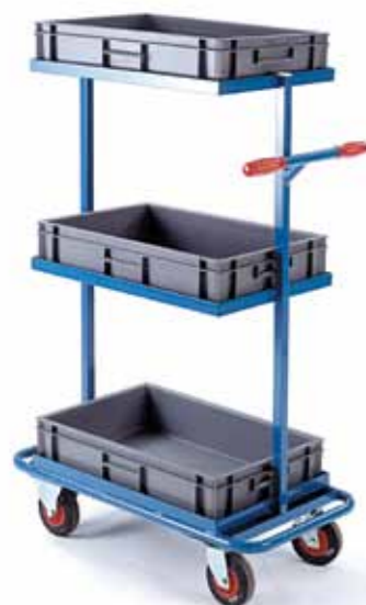
Model CT05 3 fixed tiers