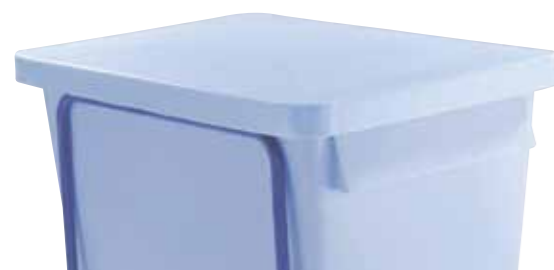
Loose fitting lid