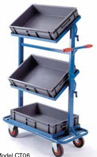
Model CT06 1 fixed, 2 swivel tiers