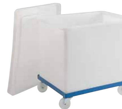
Model CT62 + PC026 lid

Loose fit lids for CT62: Ref: PC026 for CT63: Ref: PC027