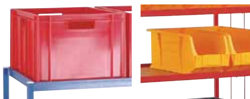
Euro Red Box