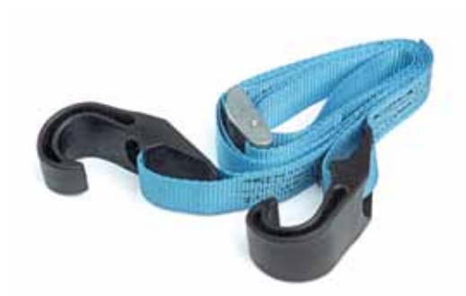
Load Strap: Ref. STP1 N.B. Colour depends on current stock