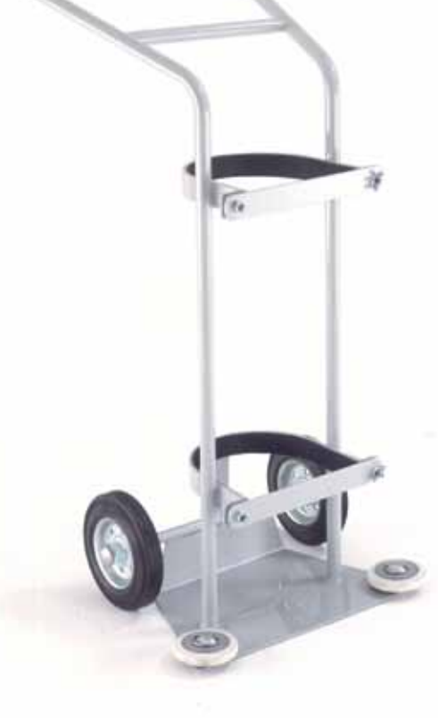
Fitted with revolving protective buffers as standard