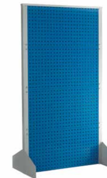
Double sided static tool panel - 4 panel high Ref: LPT-10