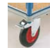
Bumper strip and total stop brake

Total stop brakes: Ref. B024 (pair) Bumper strip (Factory fitted) 1000 x 600mm deck: Ref. BS1 1000 x 700mm deck: Ref. BS2 1200 x 800mm deck: Ref. BS3