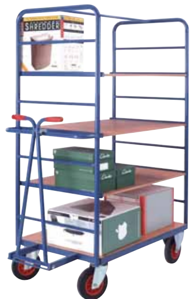
Model TS31T shown with drawbar handle