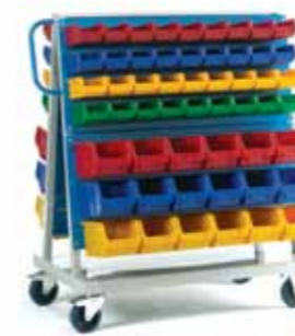
Double sided louvre panel trolley - 2 panel high complete with 72 x XL2 & 36 x XL3 bins Ref: LPT-12C (bin colours as shown)