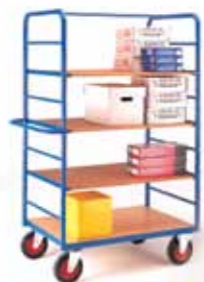
Model TS30 Standard