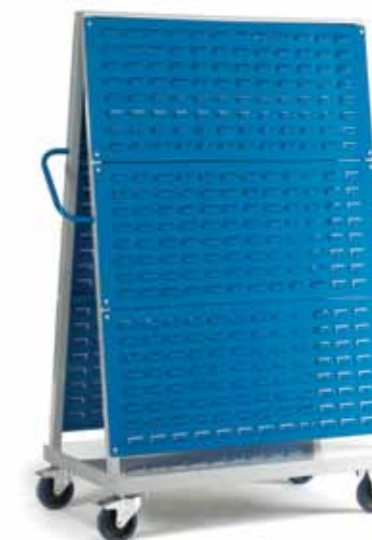
Double sided louvre panel trolley - 3 panel high Ref: LPT-13