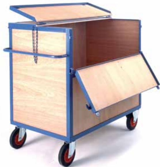
Model PLT22 Truck offering full security with contents privacy