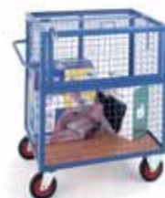
Model MT21 Truck offering full security with visibility