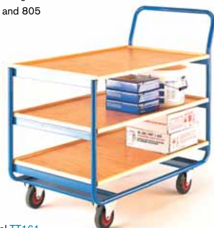
Model TT161 Shelf heights mm 285, 545 and 805