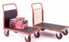
Hardwearing antislip phenolic coated decks