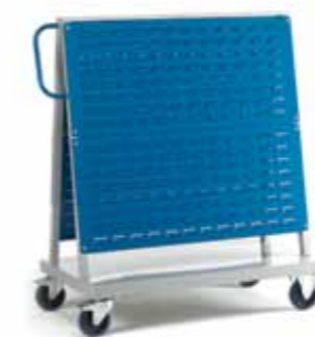
Double sided louvre panel trolley - 2 panel high Ref: LPT-12