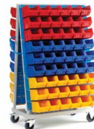
Double sided louvre panel trolley - 3 panel high complete with 108 x XL3 bins Ref: LPT-13C (bin colours as shown)