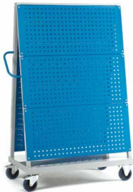
Double sided tool panel trolley - 3 panel high Ref: LPT-03