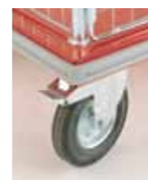
Bumper strip and total stop brake

Total stop brakes: Ref. B073 (pair) Bumper strip (Factory fitted) 1000 x 600mm deck: Ref. BS1 1000 x 700mm deck: Ref. BS2 1200 x 800mm deck: Ref. BS3