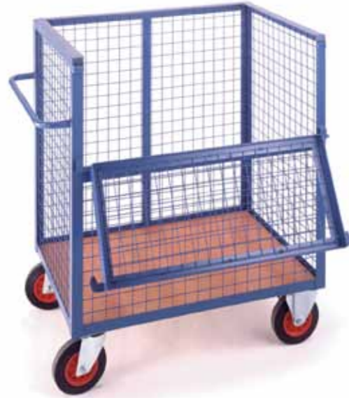
Model MT20 Popular container truck for all industries

We can manufacture Standard or Security Container Trucks to your special sizes