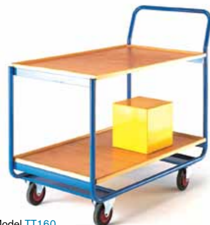
Model TT160 Shelf heights mm 285 and 805