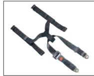
Seat belt system including hip belt