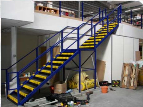
Part M staircase