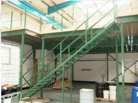
Part K staircase