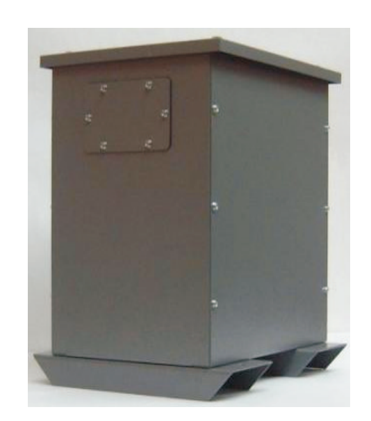
Enclosure to IP44 Made form zinc plated sheet steel Powder coated with polyester paint Gland plates are removable Gland plates must be detached from box if drilling of cutting gland holes Enclosure base has skids for forklifts Ventilated for transformer cooloing