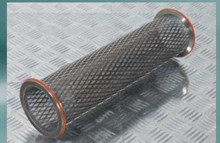
mesh filter cartridge