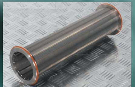
wedge wire filter cartridge - ideal for back flushing applications