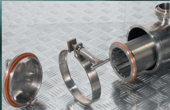
dismantled strainer shown with wedge wire filter cartridge