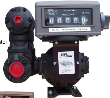
TS20AV06AT Standard strainer/air eliminator and mechanical register