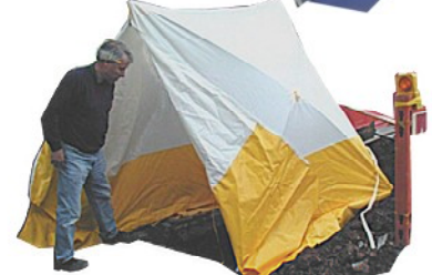
180 PZT PVC Translucent

Variable opening trench widths with one tent size