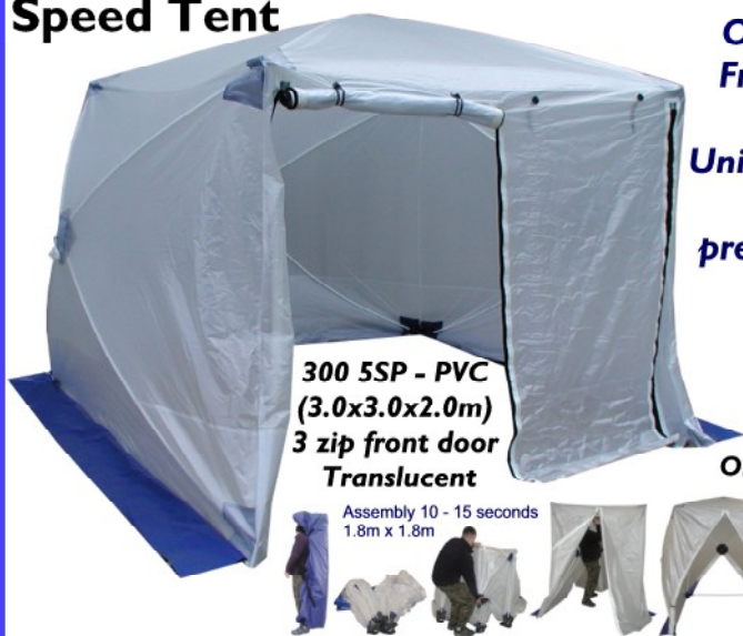
300 5SP - PVC (3.0x3.0x2.0m) 3 zip front door Translucent