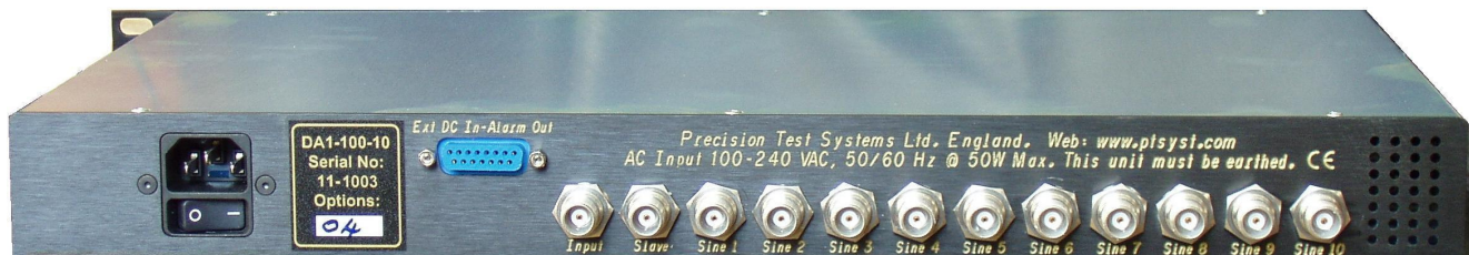
DA1-100-10 Rear view (with option 04 TNC Connectors). 1U case type.

Precision Test Systems also manufacturers the PTS50 and DA1010 series of distribution amplifiers. These models are lower cost alternatives to the DA1-100-10 but still give very good performance.