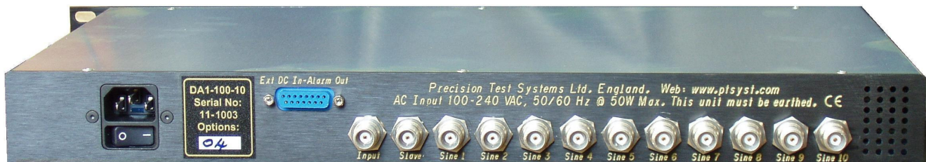
DA1-100-10-2.048MHz Rear view (with option 04 TNC Connectors).

Precision Test Systems also manufacturers the PTS50 and DA1010 series of distribution amplifiers. These models are lower cost alternatives to the DA1-100-10-2.048MHz but still give very good performance.