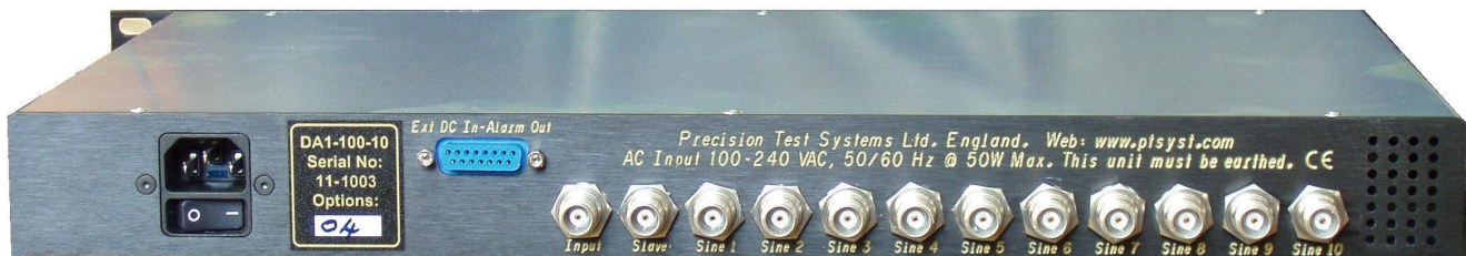
DA1-100-10-5MHz Rear view (with option 04 TNC Connectors).

Precision Test Systems also manufactures the PTS50 and DA1010 series of distribution amplifiers. These models are lower cost alternatives to the DA1-100-10-5MHz but still give very good performance.