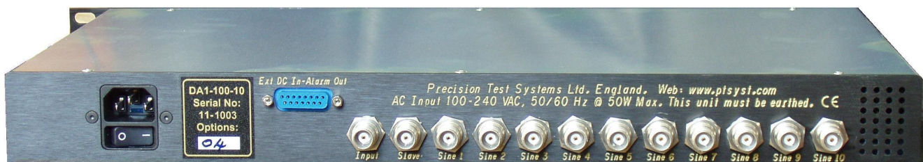
DA1-100-10-10MHz Rear view (with option 04 TNC Connectors).

Precision Test Systems also manufactures the PTS50 and DA1010 series of distribution amplifiers. These models are lower cost alternatives to the DA1-100-10-10MHz but still give very good performance.