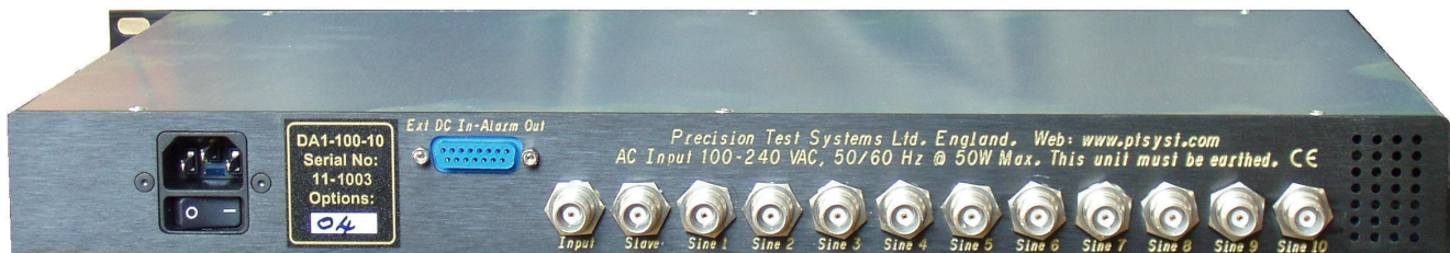
DA1-100-10-15MHz Rear view (with option 04 TNC Connectors).

Precision Test Systems also manufacturers the PTS50 and DA1010 series of distribution amplifiers. These models are lower cost alternatives to the DA1-100-10-15MHz but still give very good performance.