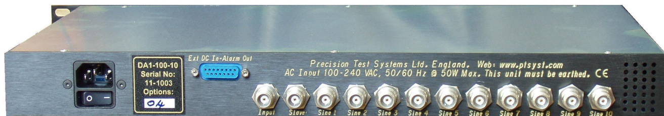
DA1-100-10-150MHz Rear view (with option 04 TNC Connectors).

Precision Test Systems also manufactures the PTS50 and DA1010 series of distribution amplifiers. These models are lower cost alternatives to the DA1-100-10-100MHz but still give very good performance.