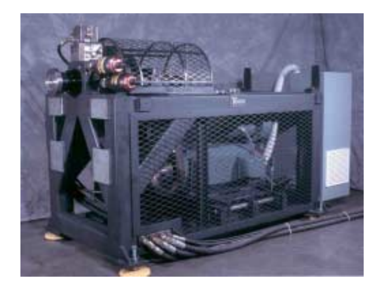
A typical Team Engine Simulation System with integrated variable speed drive.

The Team ESS uses closed-loop vibration control to provide repeatable test conditions test after test. By eliminating uncontrolled variables such as changes in engine performance over time and variations from engine to engine, the Team ESS brings a higher level of confidence to the testing process.