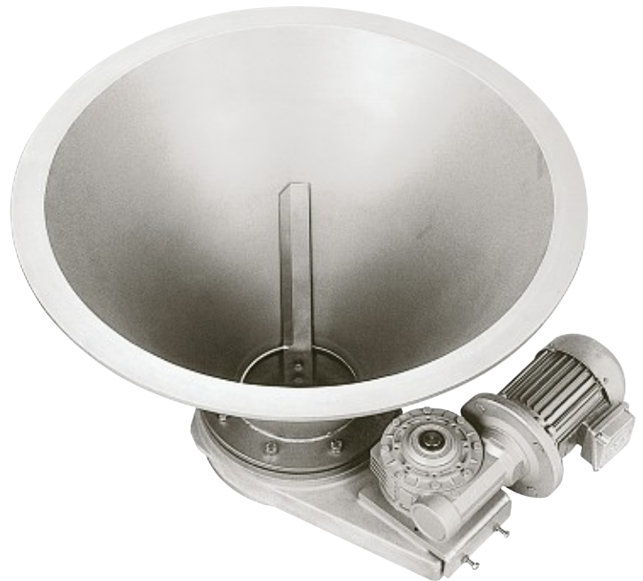
Base unit with optional hopper