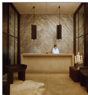
Hotel and Leisure