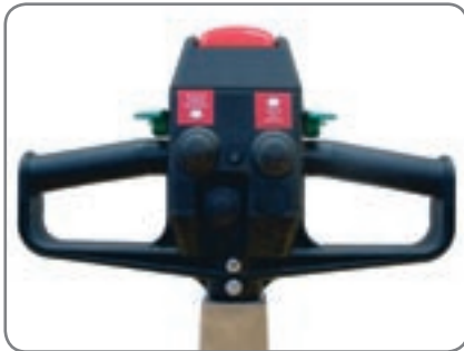
Central location of all control buttons.