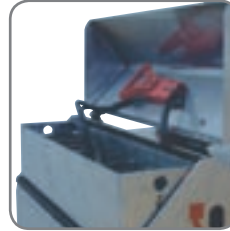
The batteries are placed in a holder - easy and quickly to exchange.