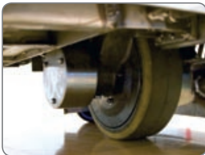
The stainless propulsion motor manages aggressive and wet environments down to -30°.