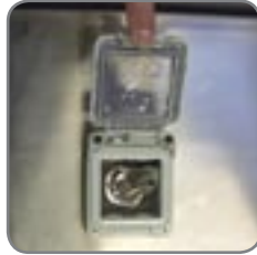
The key switch is placed in a watertight box.

All electronic parts and the motor have watertight casings.