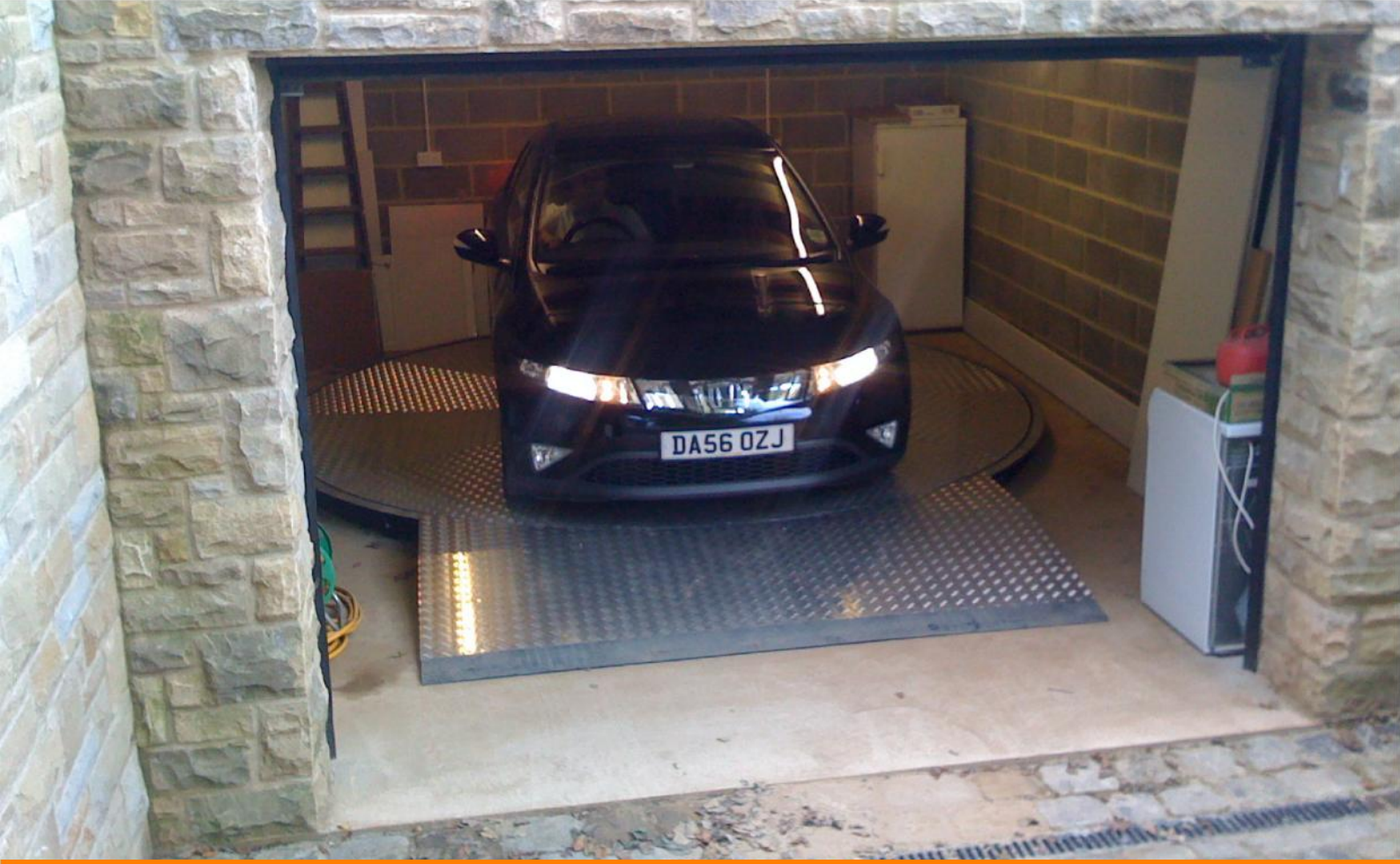
3.8Mtr Surface Mount, Motorised, with Ramp, Inside Garage