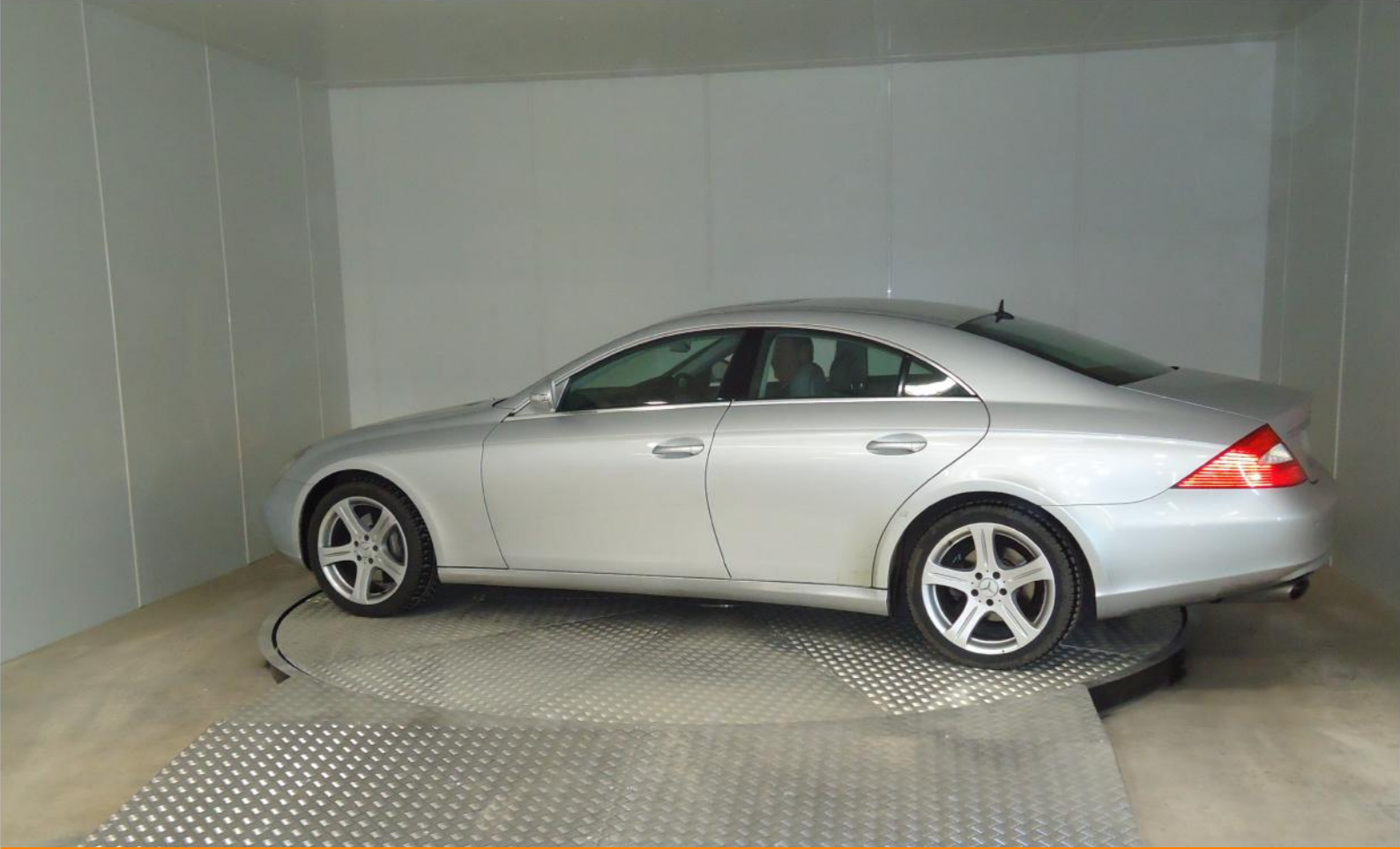
4.1Mtr Motorised, Surface Mount with Ramp, Photo Studio.