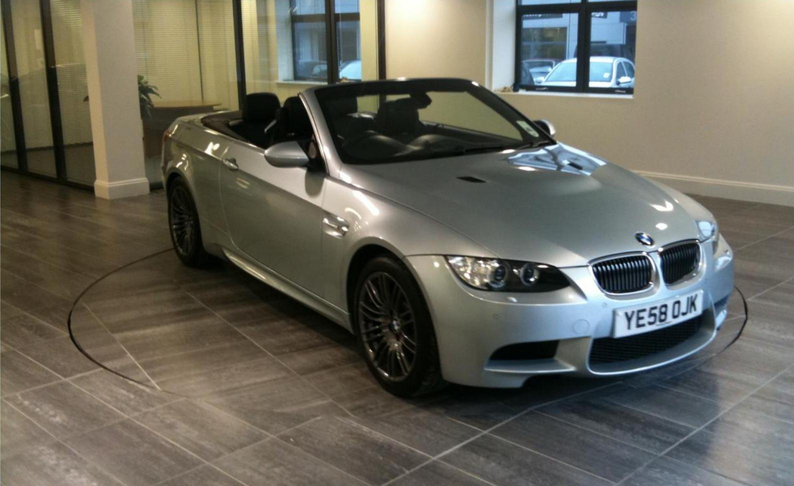
4.1Mtr Motorised, in Showroom with tiled finish.