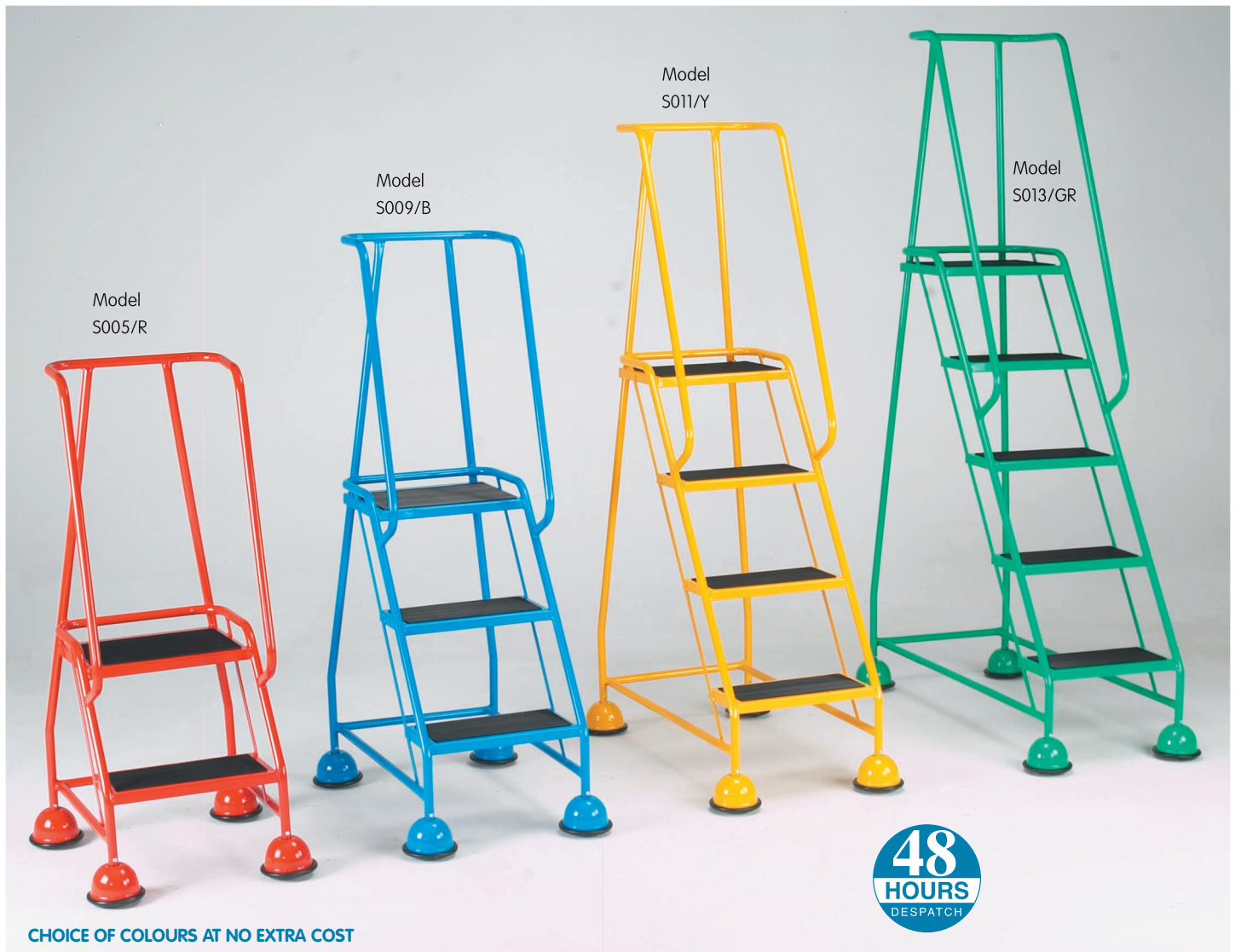
CHOICE OF COLOURS AT NO EXTRA COST

Finish: All colour finishes are hardwearing powder coated.