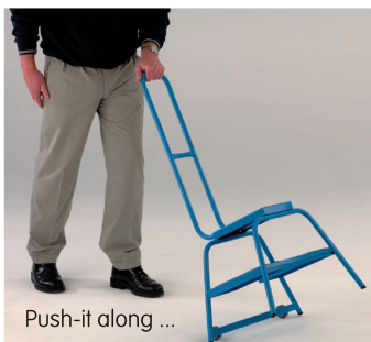
Push-it along ...