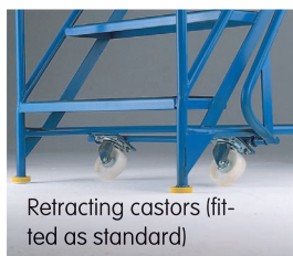
Retracting castors (fitted as standard)

Hook-on tool tray (capacity 5kg) L x W x D: 600 x 250 x 220 mm Ref S089 (Extra)