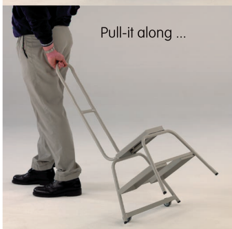
Pull-it along ...

Ideal moveable access steps for industry, offices, libraries and hospitals etc. Finished in a choice of four attractive powder coated colours.