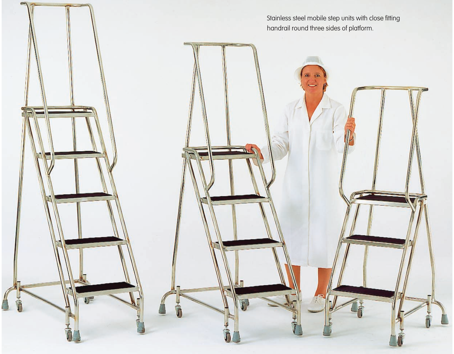
Stainless steel mobile step units with close fitting handrail round three sides of platform.