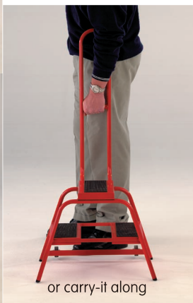
or carry-it along

Ideal moveable access steps for industry, offices, libraries and hospitals etc. Finished in a choice of four attractive powder coated colours.