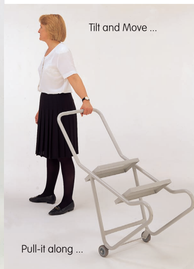
Tilt and Move ...