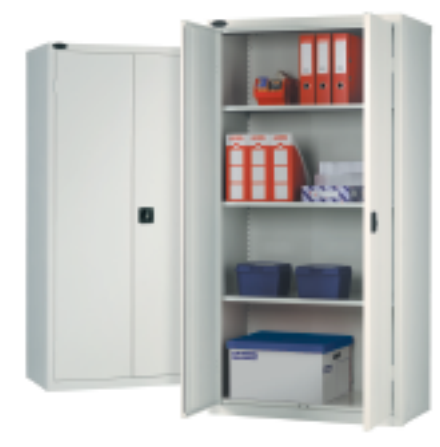
Standard Cupboard Supplied with 3 adjustable full width shelves - extra shelves available on request.