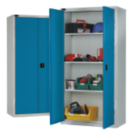
Standard Cupboard Supplied with 3 adjustable full width shelves - extra shelves available on request.