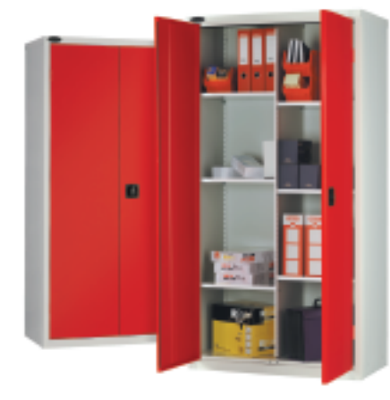
8 Compartment Cupboard Incorporates a central partition with 6 adjustable shelves.