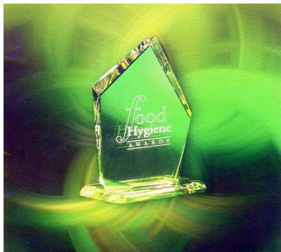
The Magnetic Sphere system is a past Winner in Food Magazine's Annual Hygiene Awards

The Magnetic Sphere system eliminates Product Wastage and reduces the amount of Effluent generated, whilst maintaining the high level of hygienic standards associated with the Food, Beverage, Health Care, Pharmaceutical, Toiletries and Fine Chemical industries.