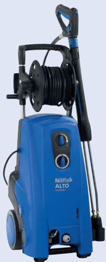
POSEIDON 4 XT