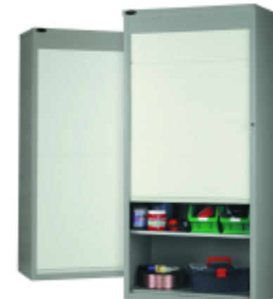
Plastic Tambour Cupboard 10 Tambour only available in smoke white or stone grey.