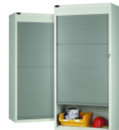
Steel Tambour Cupboard 9 Tambour only available in smoke white or stone grey.