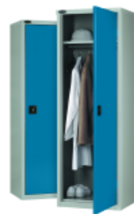
Slim Wardrobe 8