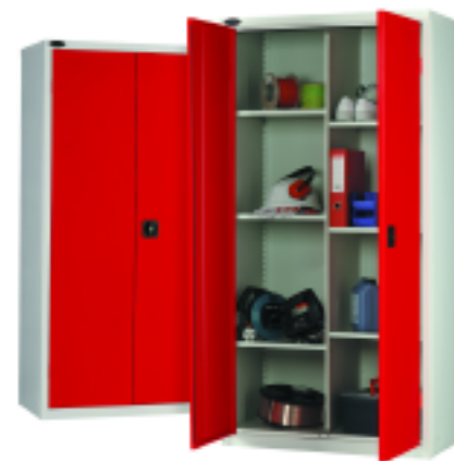
8 Compartment Cupboard 5