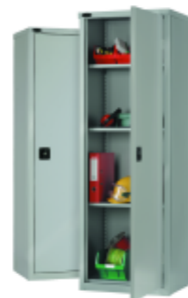
Slim Cupboard 7