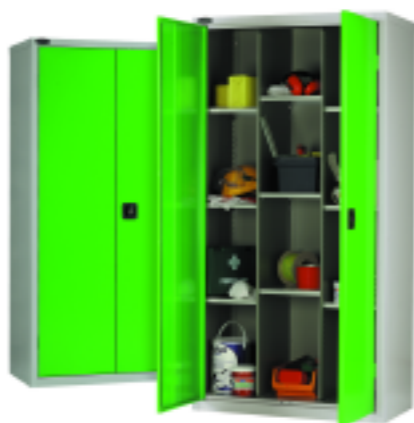
12 Compartment Cupboard 6