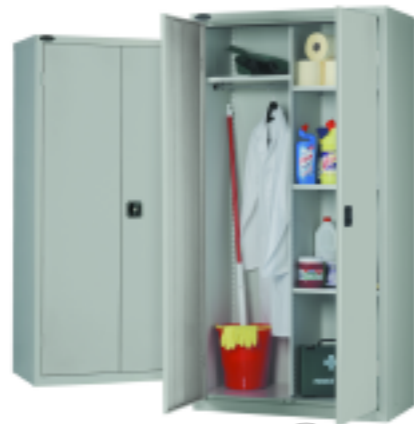
Cupboard / Wardrobe 2