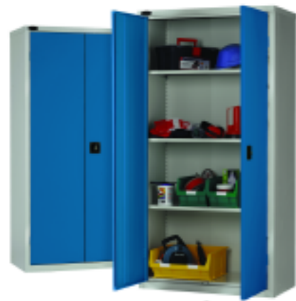
Standard Cupboard 1