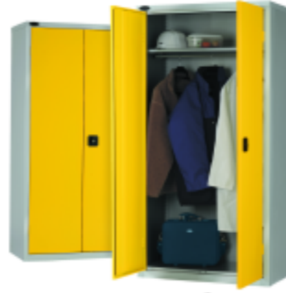
Wardrobe Cupboard 3