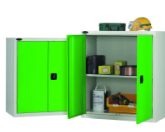
Low Cupboard 4