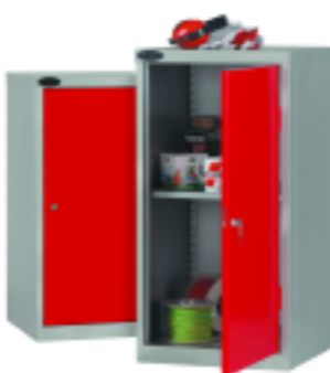
Tool Cupboard 11