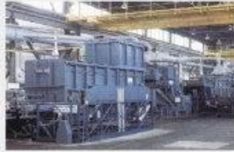
LINES FOR HEAT TREATMENT OF BOLTS AND NUTS