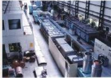
RADIATION TYPE CAB FURNACE LINE