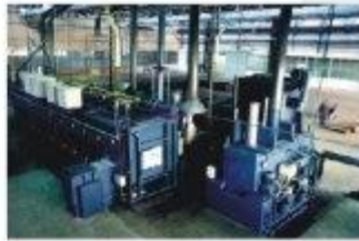
PUSHER FURNACE LINE