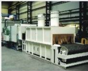
ACTIVE-ONLY® SEMI-CONTINUOUS CONVECTION TYPE CAB FURNACE