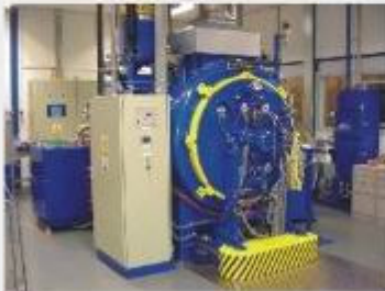
VACUUM PURGE LABORATORY BATCH TYPE CAB FURNACE