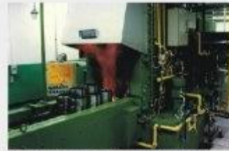
UNIVERSAL ELECTRICALLY HEATED, SHUTTLE FURNACE WITH QUENCH TANK