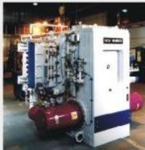
VACUUM CARBURISING FURNACE WITH GAS QUENCHING