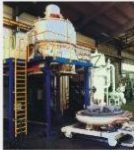
ELEVATOR HEARTH FURNACE