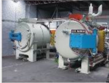
RETORT TEMPERING FURNACE, VACUUM FURNACE 10 bar