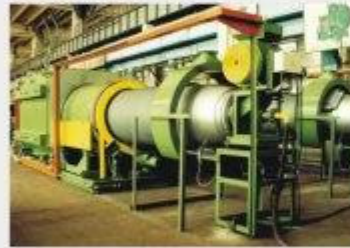
ROTARY DRUM FURNACE FOR HEATING UP OF STEEL AND BRASS PARTS IN TEMP. 150-700°C