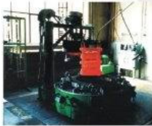
ELECTRICALLY HEATED PIT FURNACE WITH CONTROLLED ATMOSPHERE