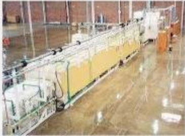
CONVECTION / RADIATION TYPE CAB FURNACE LINE