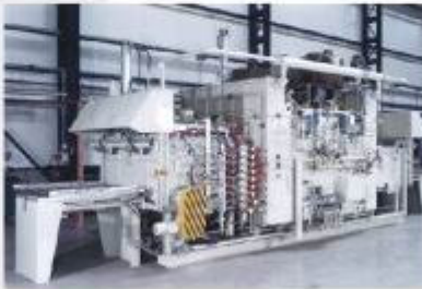
CuproBraz® THREE CHAMBER CONVECTION BATCH TYPE CAB FURNACE