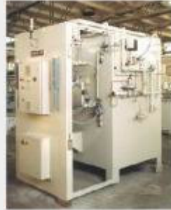
ENDOTHERMIC GENERATOR TYPE ENG