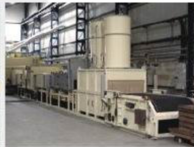
CONVECTION TYPE CAB FURNACE