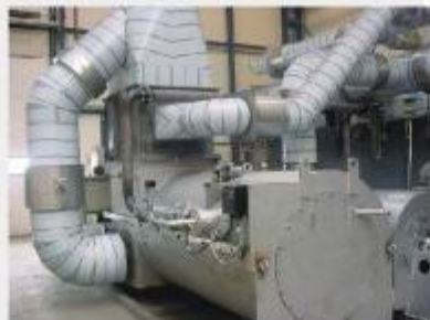
AFTERBURNER WITH HEAT EXCHANGER