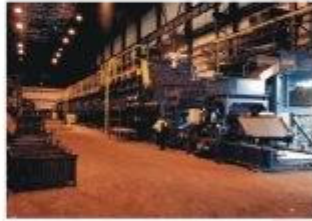
ROLLER HEARTH FURNACE FOR SPHEROIDIZING ANNEALING OF BEARING RINGS