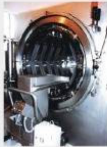
ULTRA-HIGH VACUUM FURNACE 10 -7 mbar