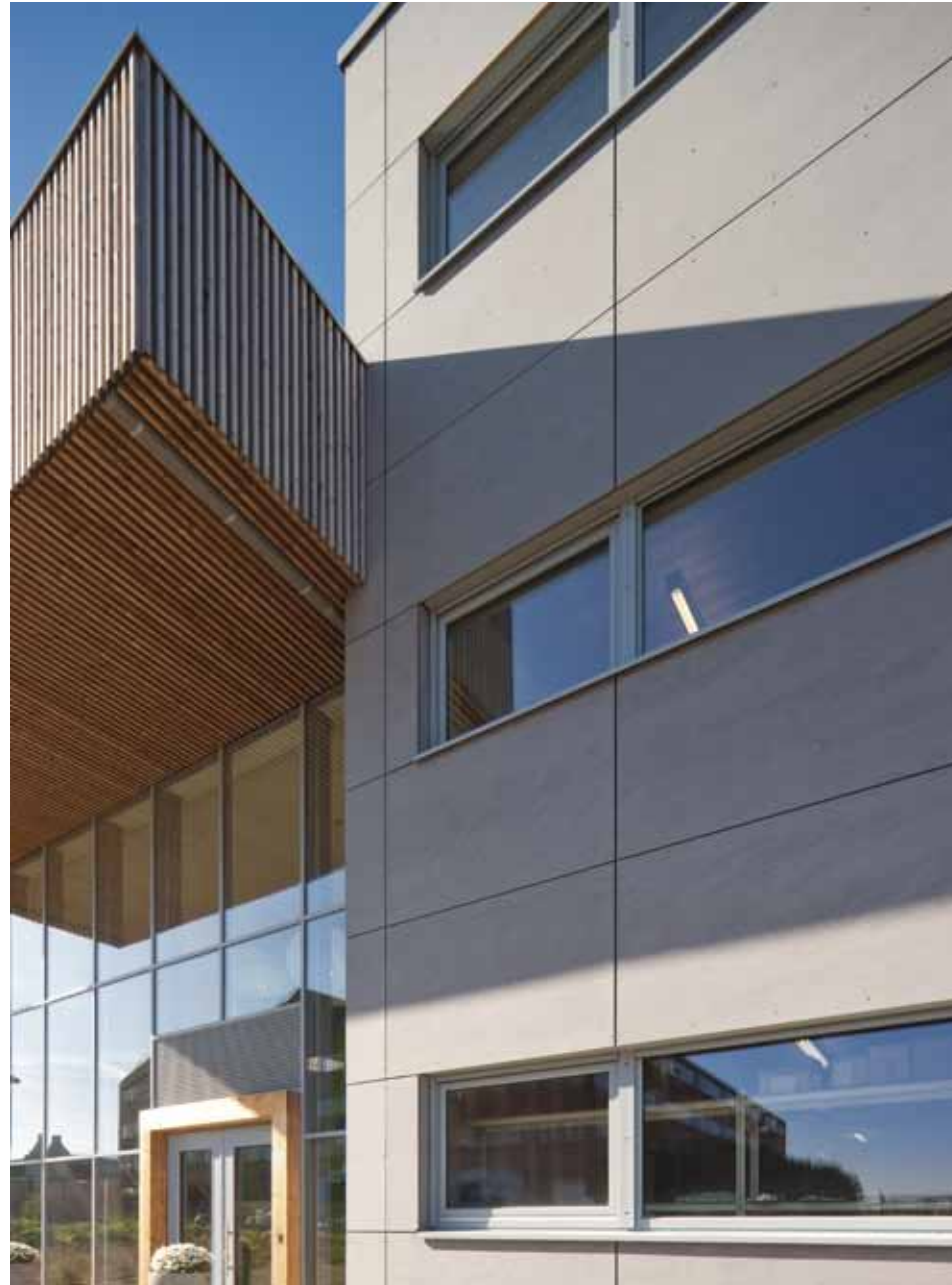
Office building | Architect: Bert Schellekens | Colour: Pebble