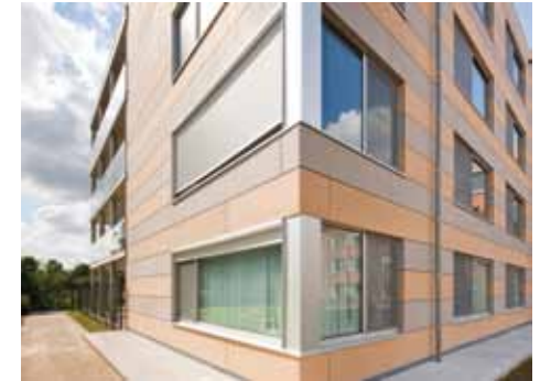
Social care centre | Architect: OCMW Kortrijk | Colours: Sandstorm, Hessian