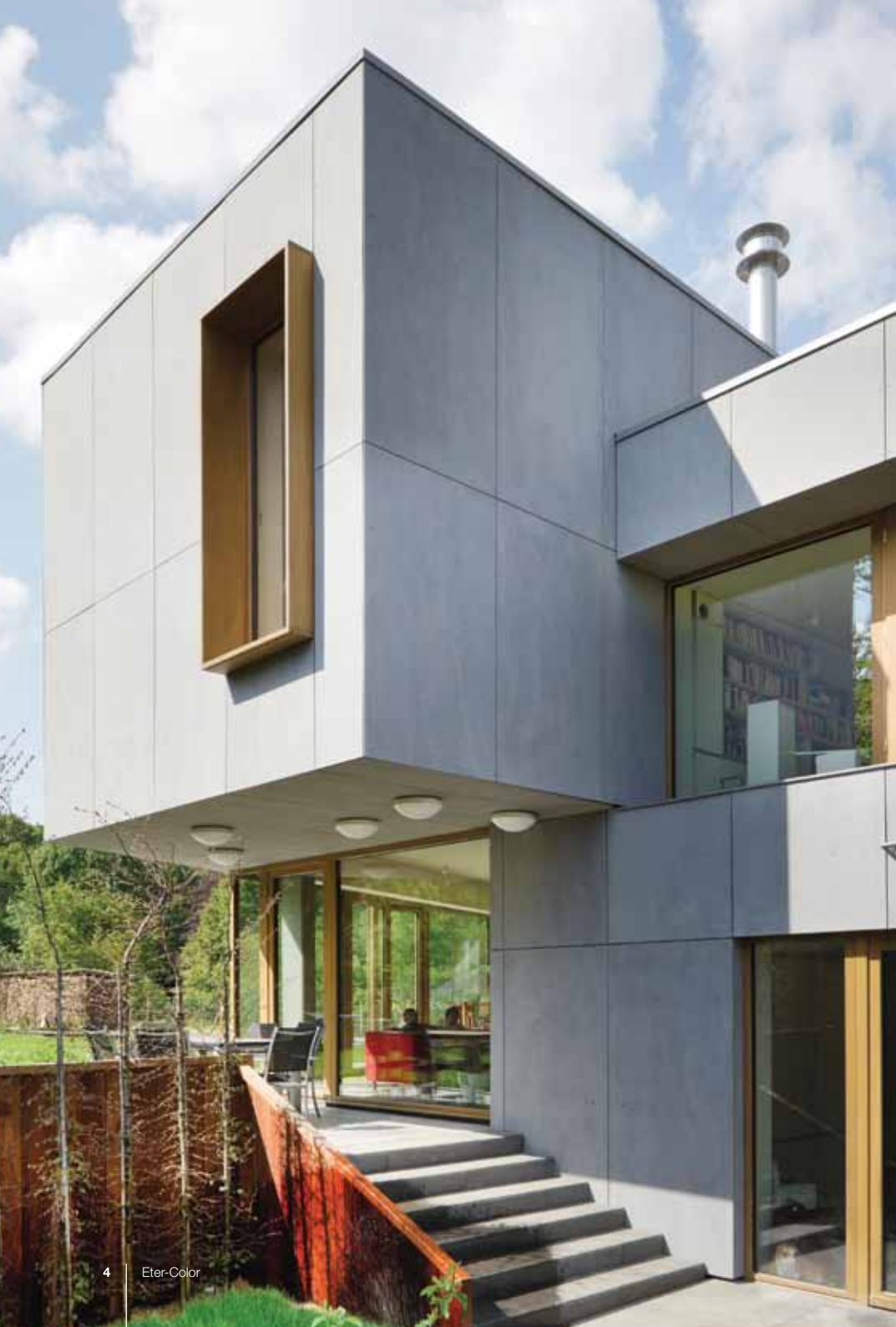
Passive house private residence | Architect: HASA Architekten BV BVBA | Colour: Pebble