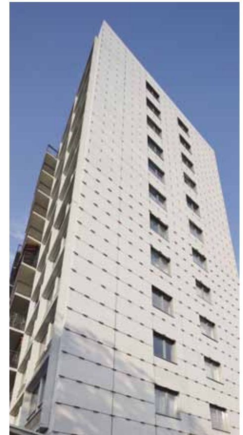
Apartment block | Architect: Dethier Architectures | Colour: Linen