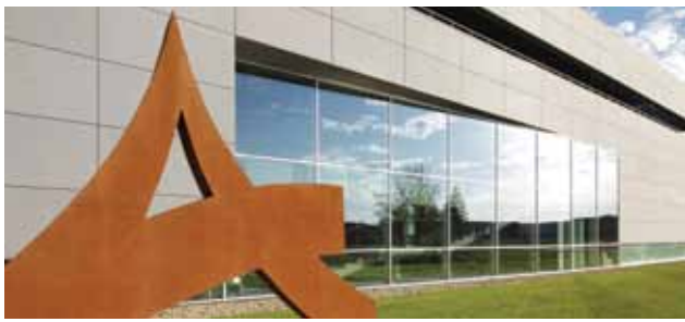
Exhibition hall | Architect: Buro Duck | Colour: Pebble

→ More for technical and fixing details Tel 01283 722588 email: info@marleyeternit.co.uk