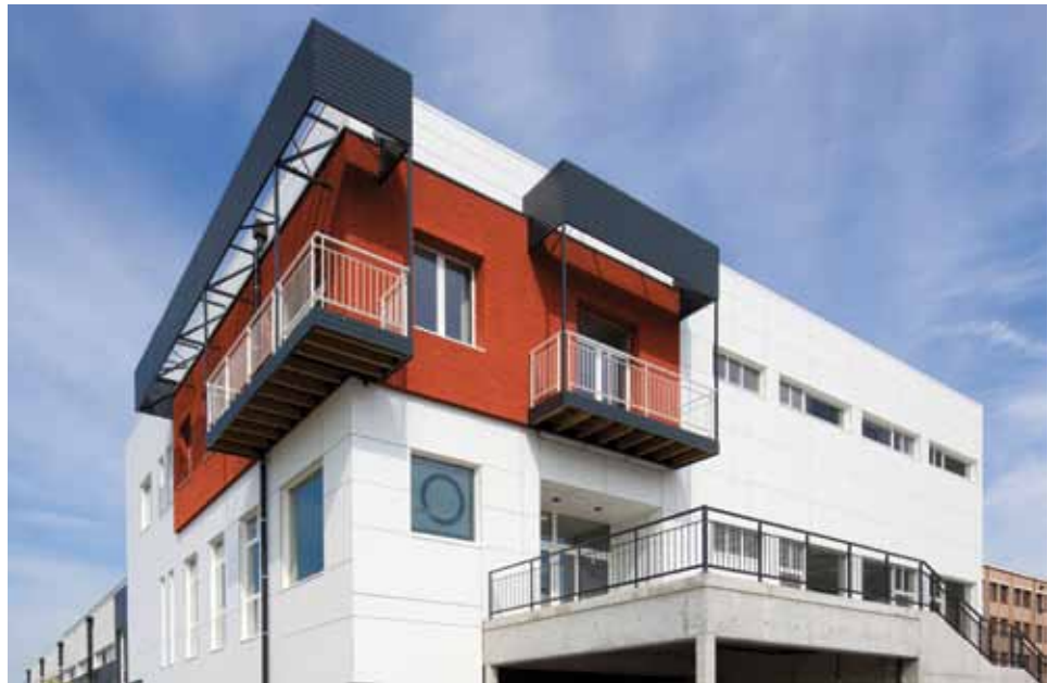
Sports centre | Architect: ULB Erasme | Colour: Calico