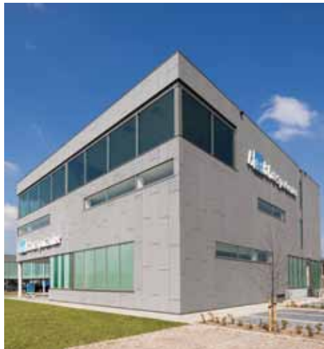
Health and fitness centre | Architect: Witteveen Architecten BNA BV | Colour: Pebble

Each panel is characterised by fine sanded lines and naturally occurring hues within the material that enhance the natural matt appearance which comes to life with the effects of light and shade to provide a distinctively beautiful facade.