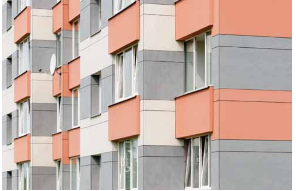
Apartment block | Architect: JSC Panprojektas | Colours: Linen, Pebble, Sahara