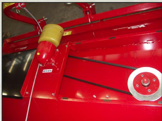
Large steel covers for easy access

The frame has been made particularly rigid by using a box-type construction on the front and rear side. Long skids on the side and grass guides between the blades in a combination with a smooth underside prevents filting and scalping, making large capacity and increased working speeds possible. The renowned Votex "Duplo" blades excel in superior cutting quality and an excellent spread of the cut vegetation. The Super Bingo rotary mower has a particularly attractive price/quality ratio