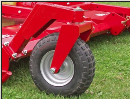
Swivel wheels 190x8