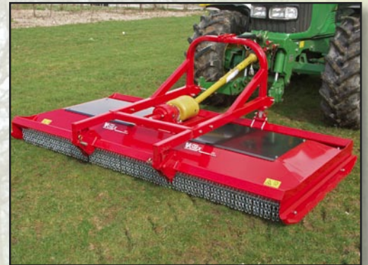
Front-trailed linkage+ chain guard