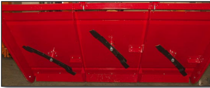
Smooth underside and partitions. No grass transport between the blades