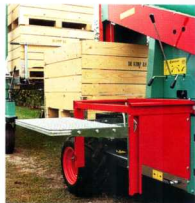
Pluk-O-Trak Junior: one picking platform on each side

The height and the direction of the picking belts can be fully adjusted. The picking belts are available in lengths of 0.5, 0.75, 1.00, 1.25, 1.50, 1.75 and 2.00 metres.