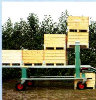
The trailer for empty bins

For even greater efficiency a fully automatic steering system is available. This enables the machine to follow the row exactly so that the pickers can concentrate fully on the job of picking.