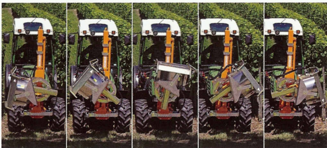
180° pivoted mounting (option)

Cleaning the machine is quick and easy to carry out by just opening the front of the housing.