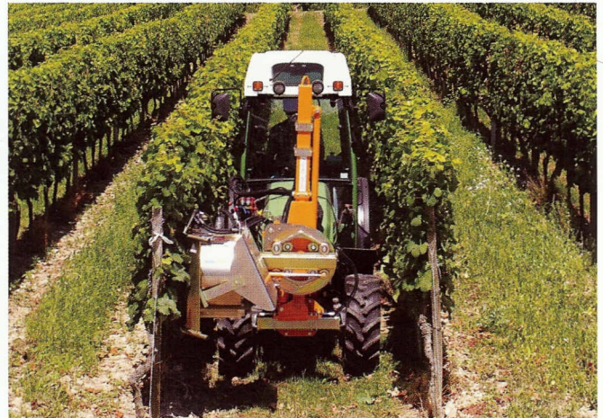
Single-sided version with 180° pivoted mounting (option) and lateral shift (option)