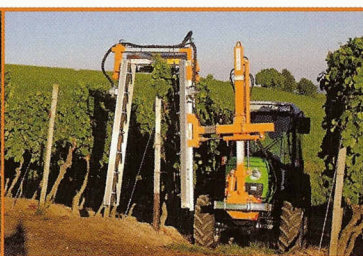
LSA 320 AU3V