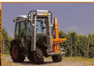
LSA 320 AU3P