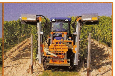
LSA 320 ALL4

We reserve the right to make technical and design changes.