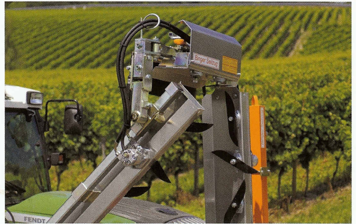
Impact protector on the over-row side

Models AC 3, AU 3 and AU 3V have manual cutting width adjustment. The AU models have angle adjustment, and impact protection on the outer cutter beam as standard.