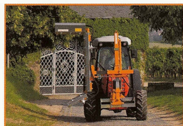
LSA 320 ALJ3

The LSA 320 has a very low oil consumption.