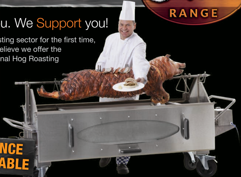
Spit Roast Machine with Motor, Spit Pole, Tools and Carving tray