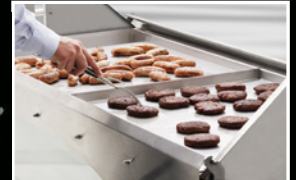
BBQ Hot Plates