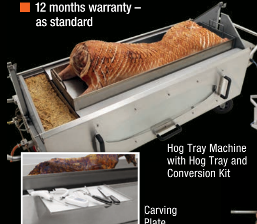
Hog Tray Machine with Hog Tray and Conversion Kit