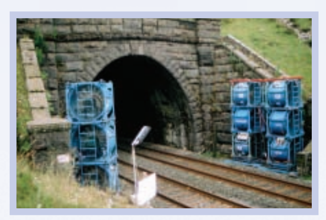
Ventilation Fans Deployed at Bleamoor Tunnel