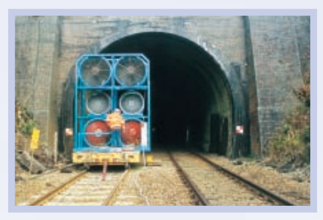
Trailer Mounted Ventilation Fans Deployed at Foxhill Tunnel