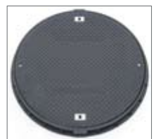
Composite Manhole Covers