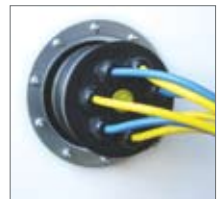
Pipe & Cable Entry Boot