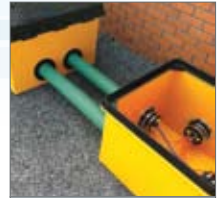
Electrical Draw Pits