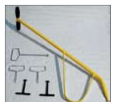
Cover Lift Sticks