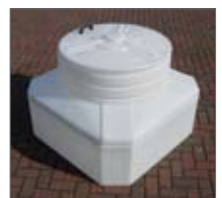
Tank & Dispenser Sumps