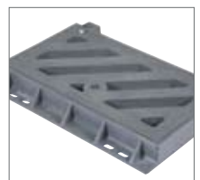
Composite Gully Grates