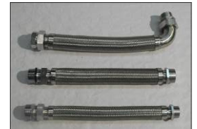
Flexible Hose Assemblies