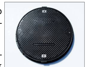
Forecourt Manhole Covers