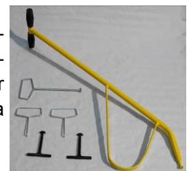
Covers Lift Sticks

Our range of covers is fully compatible with our range of water tight draw-pits and chambers should you require a comprehensively sealed underground chamber solution. Should you require a cover solution for a larger clear opening to a chamber then our modular cover range may provide a solution to meet your needs.