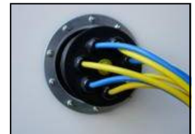
Pipe & Cable Entry Boots