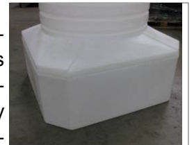
Tank & Dispenser Sumps