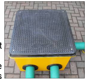
Electrical Draw Pits