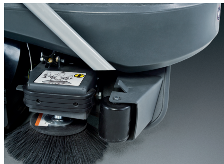
Side broom for edge cleaning