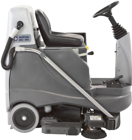
Standard detailing wand for hard to reach areas

The BRV 900 puts you behind the wheel of the first Nilfisk ride-on vacuum cleaner. This machine makes cleaning large areas such as exhibition centres and airports an easy job. Hard to reach areas can be serviced from the vehicle by using the detailing wand.