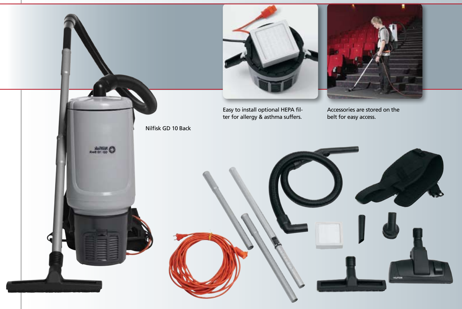
Wide selection of accessories available to meet specific applications.

The Nilfisk GD 5/GD 10 backpack vacuums surpass all criteria, with technical advancement that shows in every Nilfisk product, making fast productive cleaning at a price that won't bust your budget.