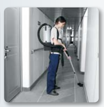
For convenient cleaning of those hard to reach places, the GD 5/GD 10 backpacks are the answer