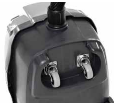
Large dust bag is designed for maximum filling The vacuum cleaner has 2 castors in the front for easy manoeuvring