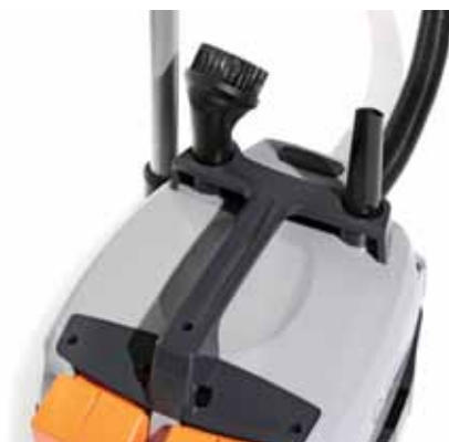
The GD 911 battery is fitted with a large carrying handle for easy lifting