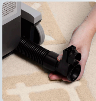
Easy access to suction hose for removal of any blockages that may arise