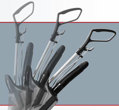
The handle is adjustable so that it is comfortable to use regardless of the user's height. Lowering of the body allows cleaning beneath furniture