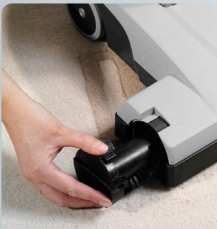
The brush is easily accessed without the need for tools for easy replacement, maintenance and cleaning