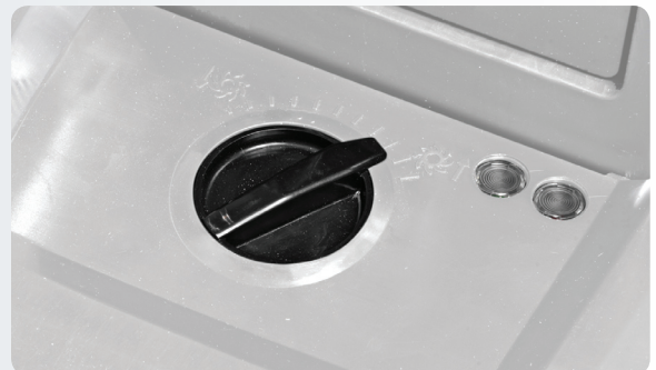
Indicators guide the user