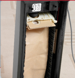
The dust bag is 'universally' sized and is easy to interchange