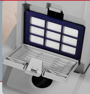
A HEPA 13 filter is optional for all models in this series so that the machine can be used where maximum dust filtration is required